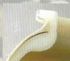
CUNO's Seamless Tank

Patented Seamless Resin Tank. Seamless construction; thicker wall section. No glue joints or heat welded bonds to fail; will not rust or corrode.